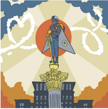
FIGURE 5: AN ILLUSTRATION OF THE GHOST OF KYIV BY DANYLENKO (2022)

Another contextual link is that to the myth of historical heroes, which, in this case, are Ukrainian Cossacks. Many works have been written about the importance of remembrance of the Cossacks to Ukraine’s national myth (E.G. SYSIN 1991; PLOKHY 2014). But most specifically regarding the Ghost, we suggest looking at the lyrics of the song “Pryzrak Kyieva” (“The Ghost of Kyiv”) by Serhei Alekseych (2022), which was uploaded to YouTube on 2 March 2022: