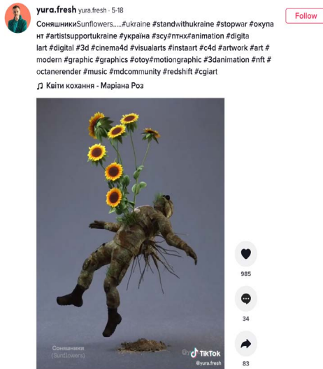
FIGURE 4: A SCREENSHOT OF A TIKTOK VIDEO BY @YURA.FRESH (2022B)

Narratives centering land as a subject give an outlet for the pursuit of vengeance and expressions of anger. In other contexts, it may be seen as cruel or morally inadmissible to enact or express a desire for revenge. However, in the context of eco-centric narratives, human feelings get attributed to inanimate objects, which allows them to escape the constraints of civil and religious morality. Cultural contextual links of romanticizing the connection to land demonstrate a pervasive aspect of mythmaking, given that the attribution of human emotions to land allows for robust forms of operationalizing difficult events and creatively channeling grief and anger. This form of projection of the war experience onto land can be a way to practice healing. By attributing the experience of the war to the land, which is more resilient to the pains of the war in the long run, the horrors of war can be put in perspective, or at the very least shared with an entity that is larger than any single human, thereby diminishing the pressure on the individual and the community.