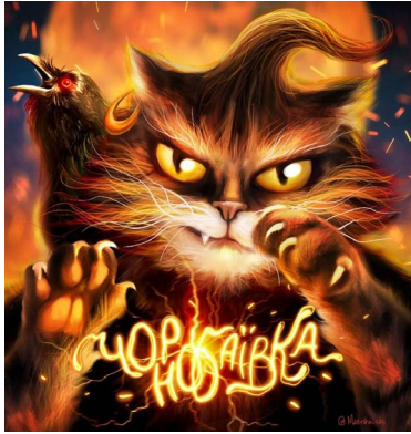
FIGURE 3: ART BY MARIANNA PASHCHUK (2022) WITH THE TEXT "CHORNOBAYIVKA"

The allusions to the magical properties of the land level out the unequal playing field between the warring parties by assigning an allegiance of supernatural forces to the land of Ukraine. The essence of Chornobayivka is also connected to the Ukrainian national identity in profound ways by referencing the imagined national past. Ukrainians are depicted as having magic on their side and as carriers of ancient magical traditions connected to the land. The story of Chornobayivka is not limited by human morality and therefore not constrained to displays of contempt for and humiliation of the enemy. The magical aspects in the story function to equalize the forces and explain the dynamics of the war, which are otherwise hard to understand or impossible to access emotionally. The magical elements in the story also situate the Us and the Them in a broader context of the perceived historical dynamic between the ‘corrupted’ Russians and the ‘pure’ Ukrainians.